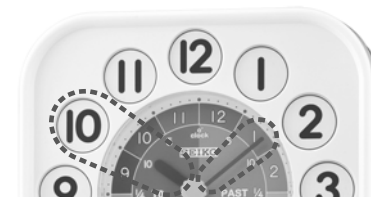
Same color on hands & numbers for easy reading