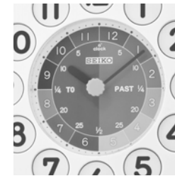
Easy to understand of time